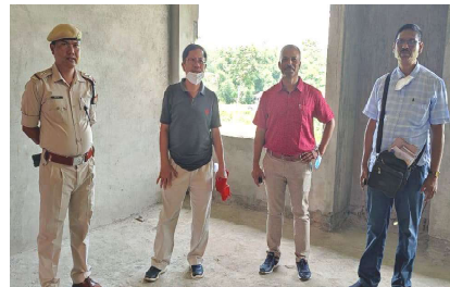
DC, Karbi Anglong visit under construction premises of GMCD