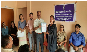
Women's Day Celebrations at GMCD