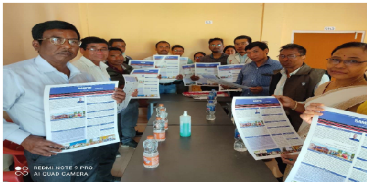
Inauguration of the First Issue of Samphri.