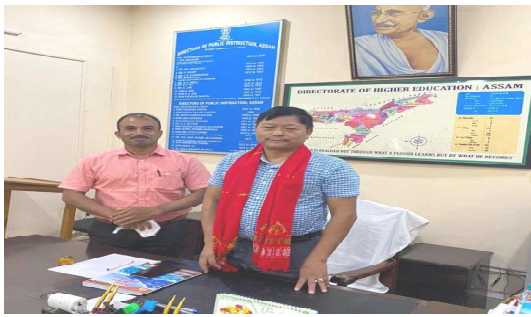
Meeting with Director, Higher Education Department