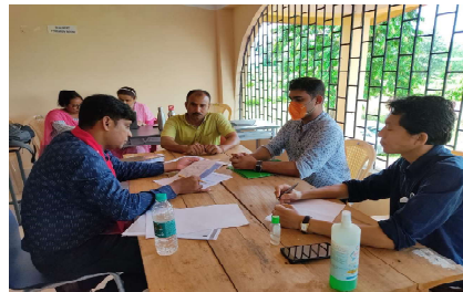
Inspection by Deputy Secretary, AHSEC